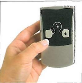
All Value-Advantage Direct-Vent Fireplaces can be operated with optional remote controls.