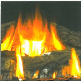
Value-Advantage models feature full, random flame patterns and glowing ember bed burners.