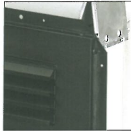
Value-Advantage installs straight and secure every time thanks to full drywall stop styled nailing flanges.