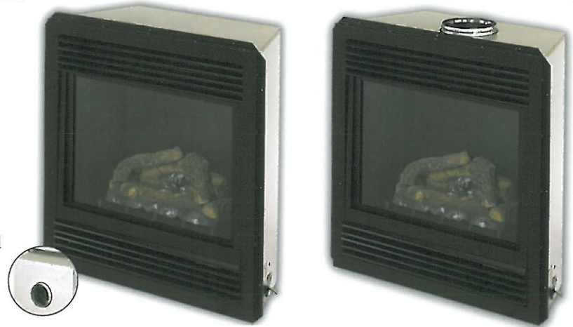
VCD36R rear-vent model

Our new Vanguard Value-Advantage Line of direct-vent gas fireplaces offers the utmost in value. Available in 36" standard size, the 20,000 Btu fireplace comes in dedicated top or rear-vent models, making installation easier.