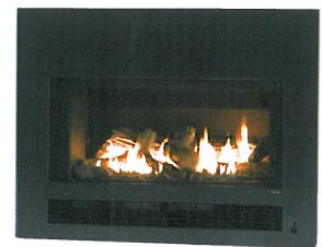
STREAMLINE BLACK METAL FRONT