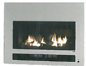
STREAMLINE STAINLESS STEEL METAL FRONT