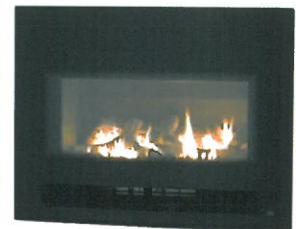
BLACK RADIUS GLASS FRONT