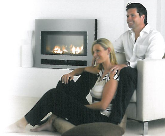
FIREPLACE SHOWN WITH SILVER RADIUS GLASS FRONT